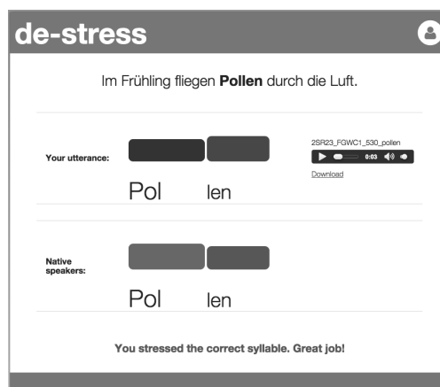
Figure 1: Student-facing interface of de-stress, showing example of feedback delivery.

of an intelligent CAPT system, in which models of relevant aspects of the learning context (e.g. the learner’s skill level, learning progress, or personal preferences) are used to automatically choose the most appropriate diagnostic and feedback methods.